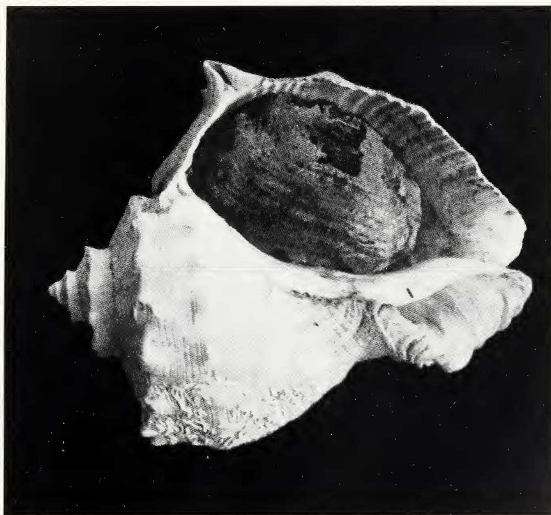
Fig. 1. Rapana venosa : a, ventral view of the specimen collected in the area of Micra (h=110 mm, D=92 mm); b, dorsal view of the same specimen.